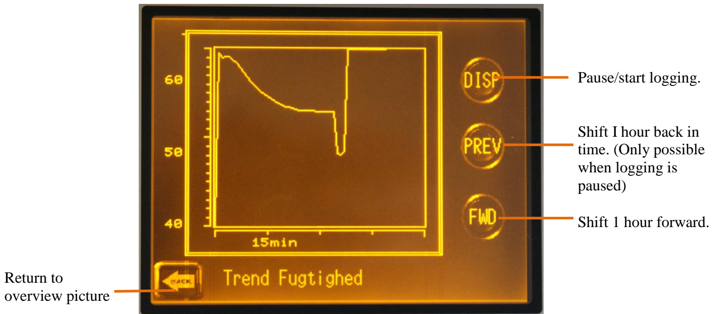
Fig. 3 Trend pictures.