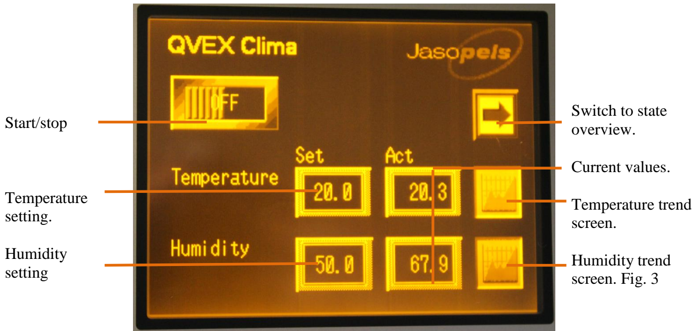
Fig. 1 Overview picture.