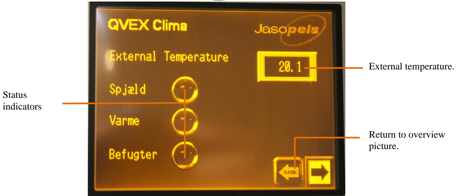
Fig. 2 Status picture.